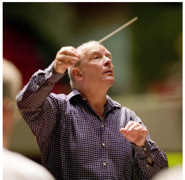
Christopher Hogwood

considerable output of music and didactic writings has only been available in piecemeal fashion, much of it never reissued since his lifetime except in facsimile, and thus largely inaccessible to the modern performer. This lack of material designed for practical performance has concealed the enormous originality he showed both in writing and re-writing his own music, and that of Corelli. Francesco Geminiani Opera Omnia rectifies this omission with the first uniform and accurate scholarly edition of all versions of his music and writings in a form that allows pertinent comparison and reevaluation.