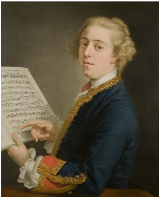
Andrea Soldi (1703–71), Portrait of Francesco Geminiani .