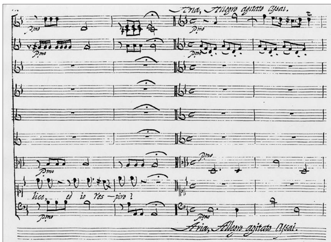
Autograph score of Boccherini's Aria Misera, dove son! - Ah! non son io che parlo (G 548)